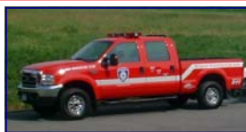
Fire Prevention Team's New Ford F-350

they visited many schools and organizations to educate