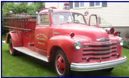
MVFA's 1948 Chevrolet Pumper

One of the MVFA's members has come back to the neighborhood and rejoined the department. The 1948 Chevrolet pumper that loyally served the Mohegan/Cortlandt/Yorktown community for nearly three decades found its way home this year where it will