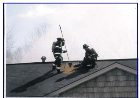
Ventilating a Roof