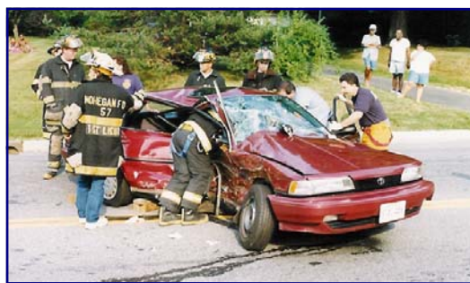
... at an Auto Accident