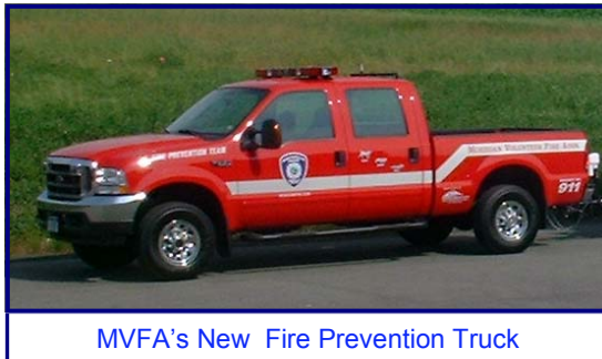
MVFA's New Fire Prevention Truck

Child Care, Strawberry Learning Center, Flying Goose Nursery, Yorktown Parks & Recreation, Philipstown Junior Fire-fighter Camp, Kiddie Kottage, Pound Ridge FD, Putnam Valley FD, and several groups of Girl Scouts & Cub Scouts.