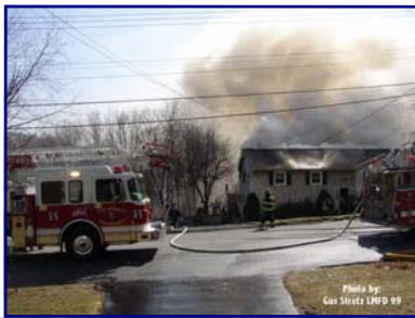
Mohegan Volunteers at a House Fire

Did You Know? Back in the early days of the fire service, most of the fire apparatus was horse-drawn. Dalmatians originally served to guard firehouses and direct the horses. They are still commonly considered mascots of modern fire departments.