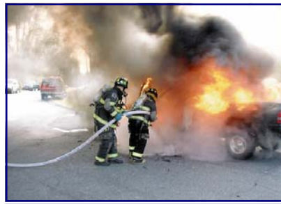
... at a Car Fire