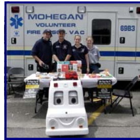
The MVFA VAC Injury Prevention Team at Yorktown Town Day

nized as being one of the best in New York State. While that program focuses largely on fire safety, the VAC Injury Prevention Program concentrates on areas such as bicycle safety including helmets, car seats and proper buckling, poison awareness and fall injuries. They recently purchased "Andy the Ambulance" which is a robotic, talking ambu-