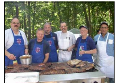
... at the State Police/ Mohegan Volunteer Fire Assn. Picnic