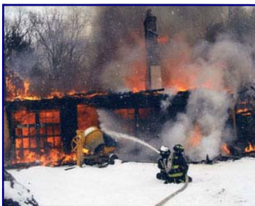
Mohegan Volunteers at a Locust Ave Fire

-Benjamin Franklin, American Patriot, Founding Father and Volunteer Firefighter