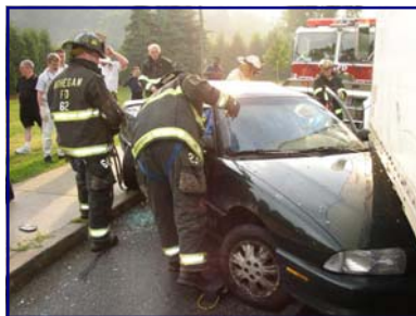
... at a car extrication on East Main Street