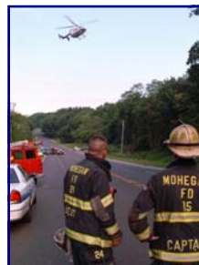
...establishing a landing zone