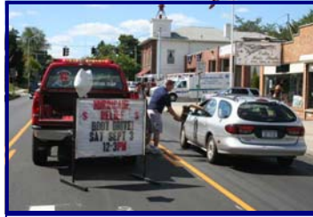
MVFA Boot Drive

The Mohegan Volunteer Firefighters thank you for your support!